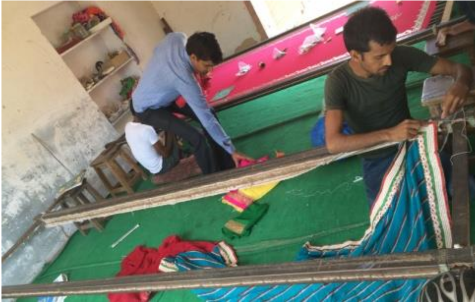
Adda (Wooden frame)

Craftsman tug the fabric on Adda (which is a wooden frame) for doing the work.