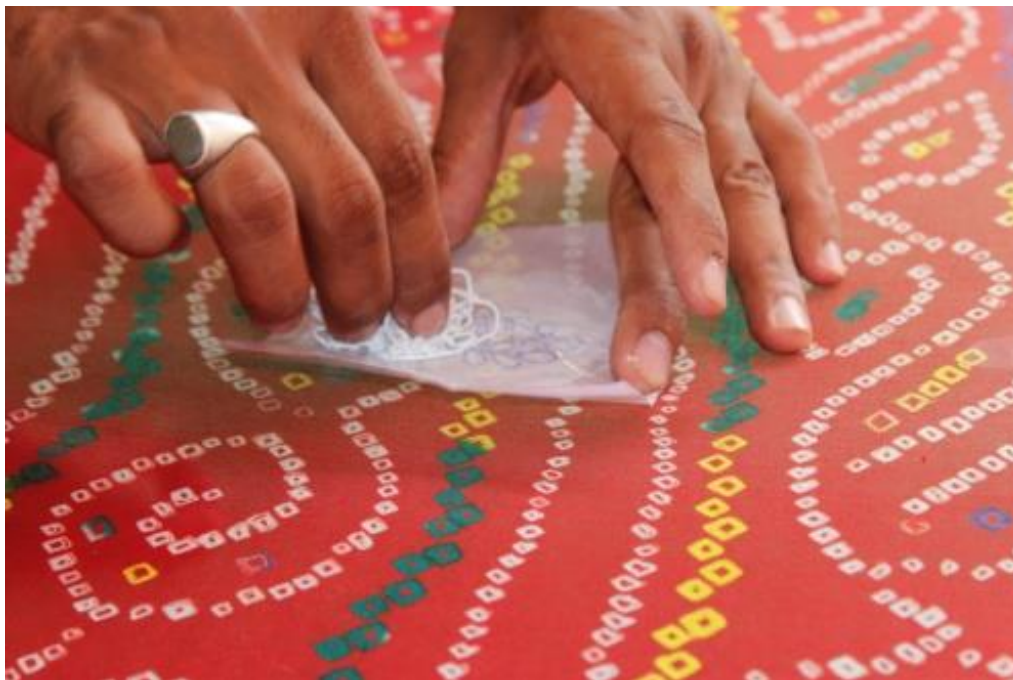
Motifs is being traced

>Motifs are traced on it using the tracing paper and the paste (a mixture of chalk powder of and kerosene oil) with cotton or cloth.