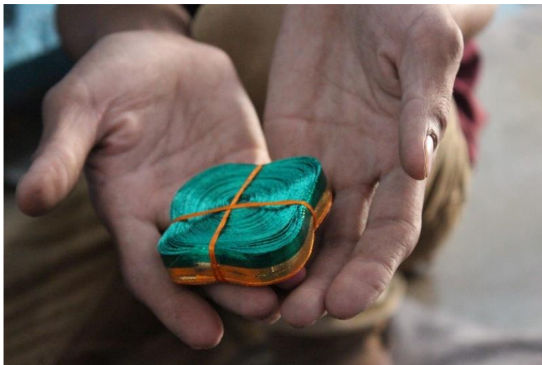
Tied Gota roll

>Later on it is supplied to the people to make laces, for making different designs on it or for the punching process with which the different shapes comes out. And then finally supplied to the artisans for the creative work.