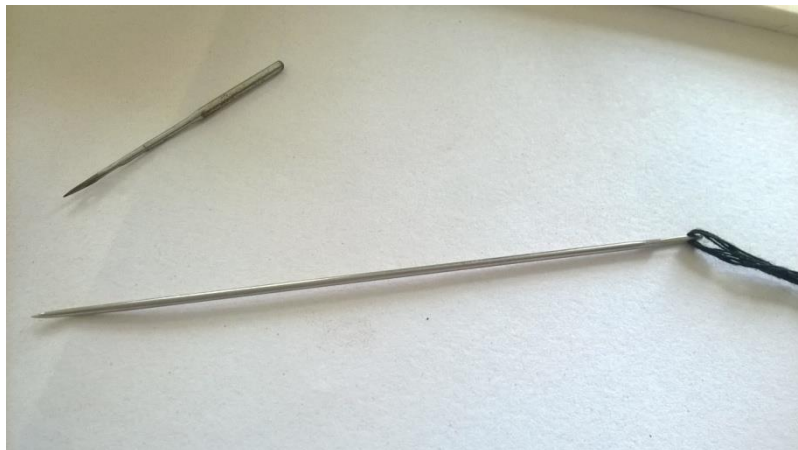
Needle( Sui )

It is used in embroidery work and also while tucking the fabric on Adda .