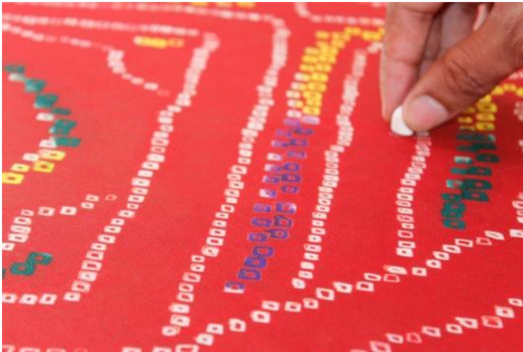
Marks made by the chalk

>Marks are put by chalk on the fabric where the motifs have to be traced.