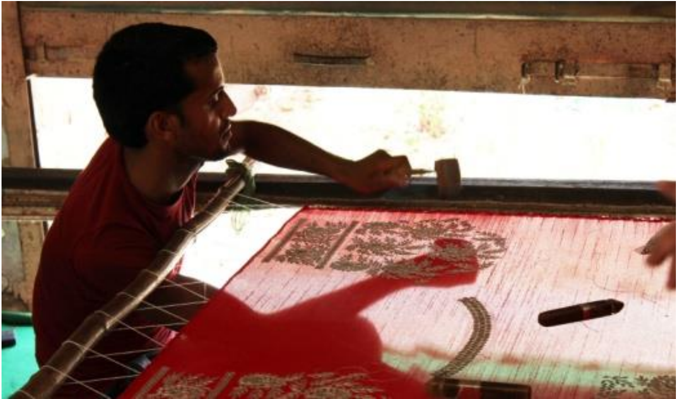
The work is being beaten by the Peetan

>Subsequently the entire work is beaten with the help of the instrument known as PEETAN (hammer and block made of wood).