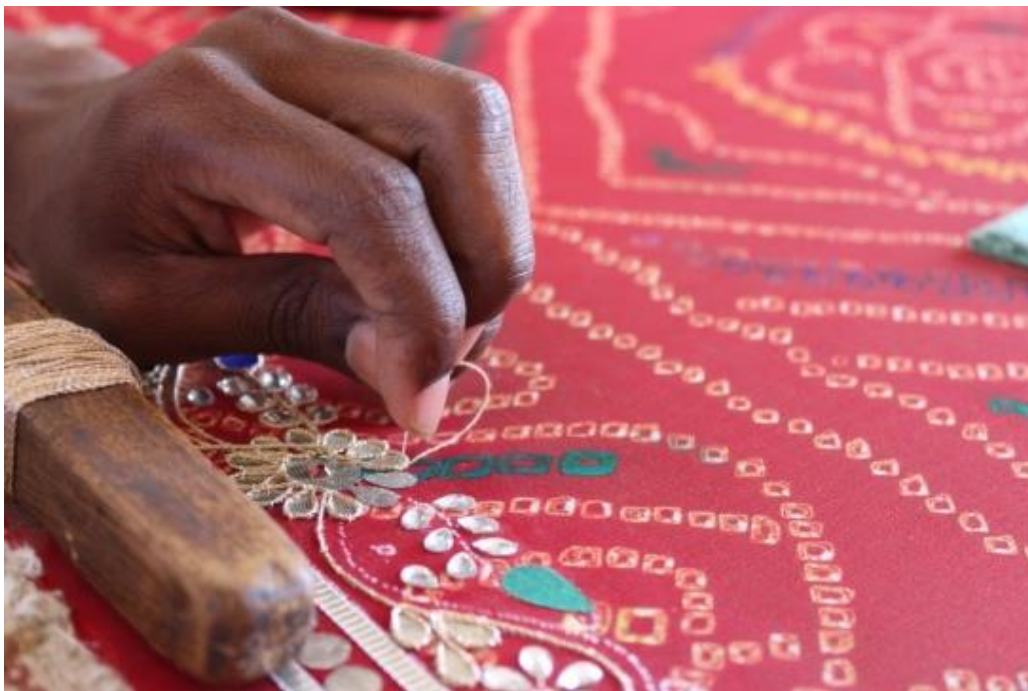
Embroidery is done by Zari therad

>After pasting the Gota the edges are embroidered with the Zari thread to give it aesthetic look and make it more elegant.