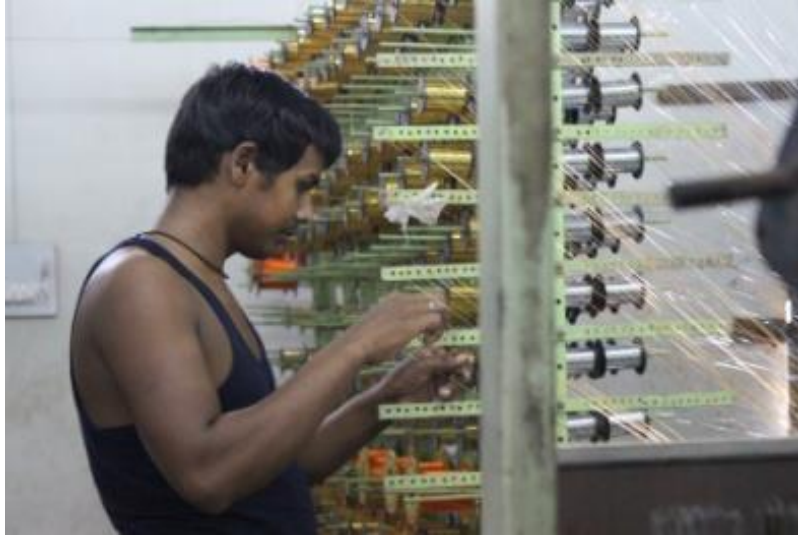
The man is putting Yarn on machine