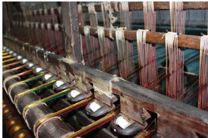
Gota ribbon is being weaved