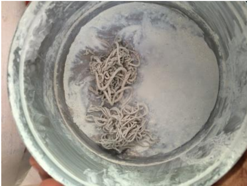
Paste of chalk powder and kerosene oil

The paste chalk powder and kerosene oil is used for tracing the designs or motifs on the fabric.