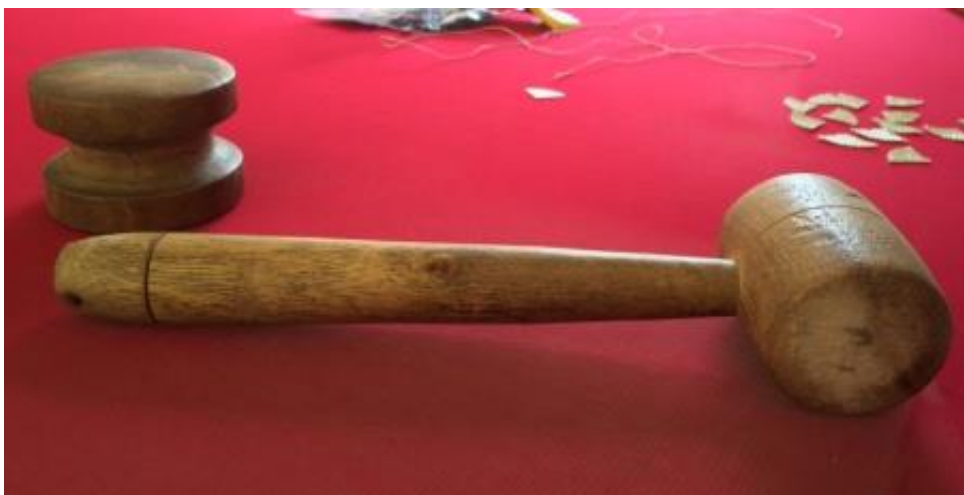
Peetan (Wooden block and hammer)

Peetan is a type of hammer which is used to beat the work and set it.