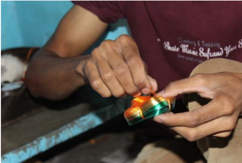
Roll of Gota ribbon is being tied

>The ribbons are cut into desired lengths as per the need of the customers and roll is made and tied.