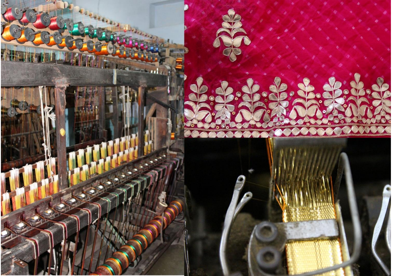
Weaving machine at Ajmer and finished product at Nayla.