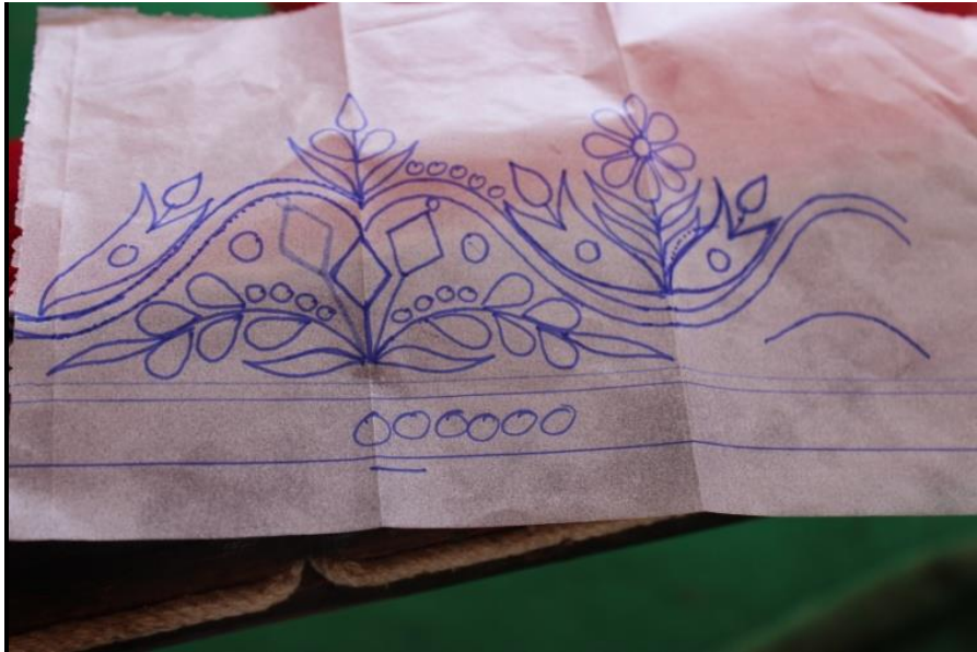
The design made on a tracing paper

>Motifs which have to be made on fabric are first drawn on tracing paper then perforations done are on it through pin so it could be traced on fabric.