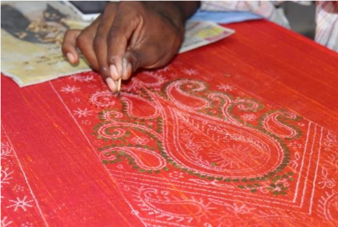
Gota Patti is being pasted

> Then the Gota patti is pasted on the fabric traced design.