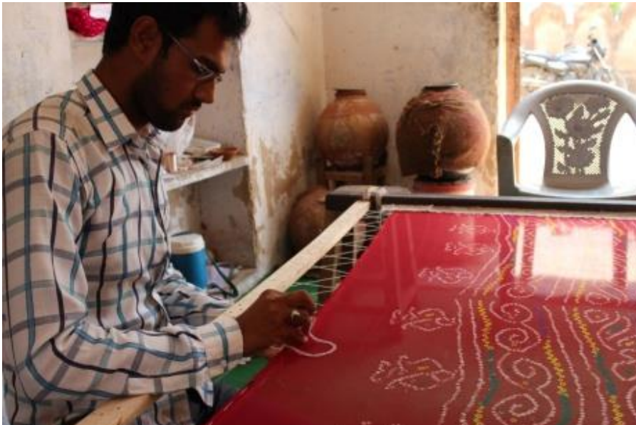
The fabric is tucked on Adda

>The fabric is switched edge to edge on Adda (frame) to make the work of the artisans easy.