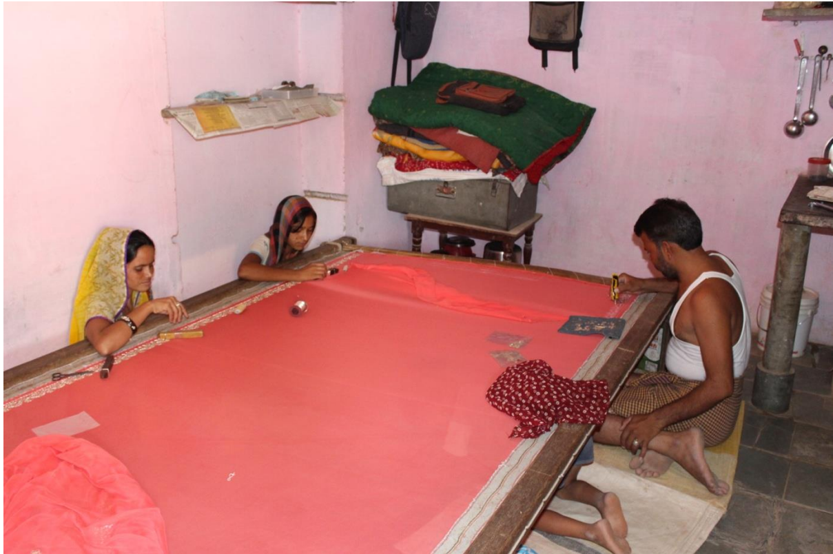
Male and female practicing the Gota craft.