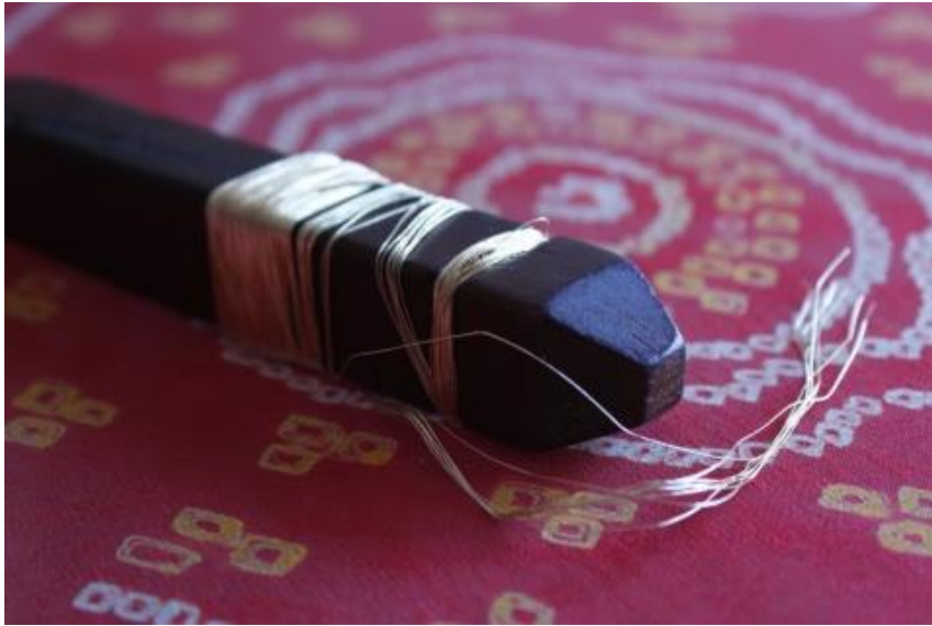
Fatelah (wooden block to rap therad)

Fatelah is a wooden block on which a Zari Thread is rolled to work easily.