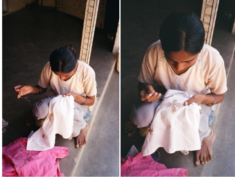
Lady using needle for embroidery

4) These patterns, motifs and colors are usually very specific to the particular region if created for the local market or for personal use. For the outside market, variations in colors and motifs are made to suit buyer requirements. A specific stitch or combination of stitches is used to decorate the base material.