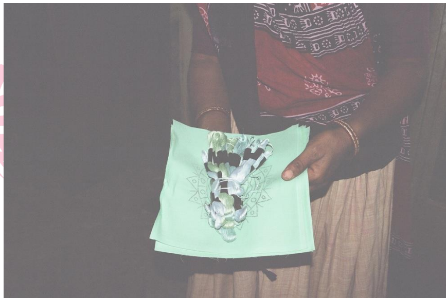
Traced pattern on fabric