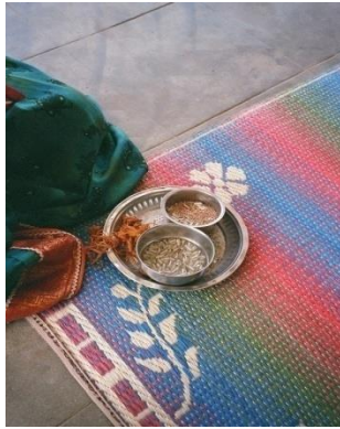
5.2 Mirrors, beads, very fine metal wires (silver, gold, copper etc)