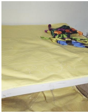
5.3 Fabric ( cotton, silk or any other), leather etc