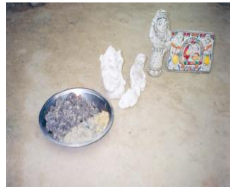
Mixture of paper pulp, multani mitti, methi powder and fevicol, products made out of it and final products after coloring