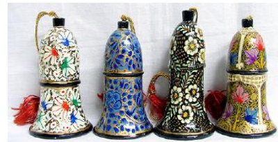
Papier Mache Bells

* Box is the ubiquitous papier mache product but a new varied product range is also available. Letter racks, candle stands, coasters, small bowls, trays and jars are commonly made and sold daily use products, in ornamental products small bells and chimes in an array of colors also sell well.