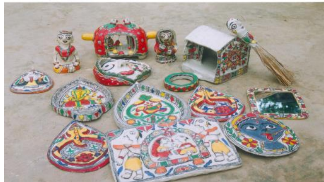
Decorative as well as utilitarian products

But with the change in consumer taste and demand they started making decorative as well as utility products for daily use.