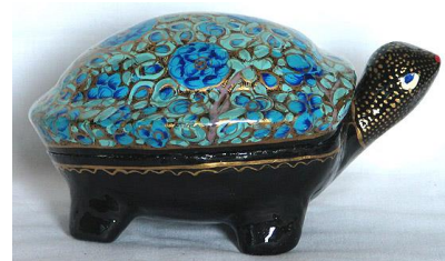
Papier Mache Box