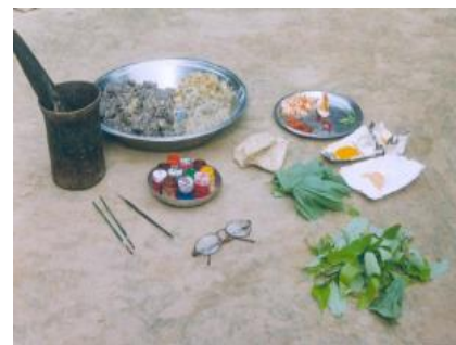
Raw Material used in the process of making Products

product and to stick paper pulp but now Multani Mitti is used as it gives a better finish to the products.